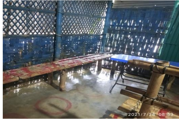
Water clogging at waiting area