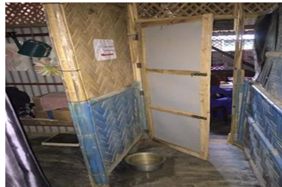
A manger was placed to collect water

In camp 1 site 01 catchment area, 5 people are reported dead and 3 are severely injured. 1 shelter is fully damaged, 35 shelters are partially damaged and 21 shelters are affected due to flood. 10 major land slides and 71 small landslides are reported from the community and 4 HHs have been relocated to temporary communal shelters. 2 pathways and 2 stairs are damaged. In the INF, the roof was leaked in some points and water was falling from there. By using tarpaulin, another layer was made instantly to overcome the situation. No major damage was reported in the facility.