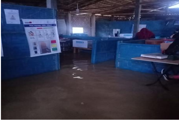
Water clogging inside the facility