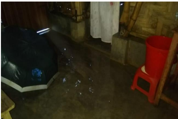
Water clogging inside the facility due to water fall from roof leakage

In camp 8W site 01 catchment area, 1 shelter is fully damaged, 10 shelters are partially damaged, 73 shelters are affected by the flood, 1 pathway & 2 stairs are damaged and one bridge is flooded due to heavy rain fall. In the INF, the roof was leaked near CMAMI corner, breastfeeding corner and OTP/TSFP distribution point and water was falling from there. By using tarpaulin, another layer was made instantly to overcome the situation. The INF is situated on the hill and a small proportion of barrage has been damaged nearby the facility. No major damage was reported in the facility.