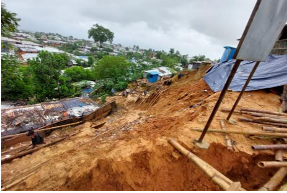
Damaged protection guide-wall