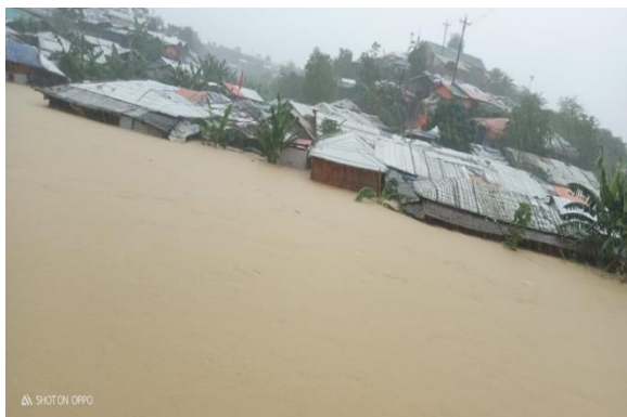
Flood situation in the community

Due to heavy rainfall most of the drain that is used to smooth pass of water were over flooded in camp 5. Therefore, about 400 HHs were badly affected. In the affected households, there are 408 children aged under 5 years. The INF is situated beside a canal. Yesterday during heavy rainfall, the canal was over flooded and water entered into the BSFP section which created problems to continue the BSFP activities. The rain intermitted at around 12 noon and the center was cleaned within 40 minutes to continue the services smoothly. No major damage was reported in the facility. However, outreach activities were disrupted.