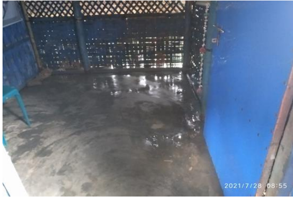
Water clogging at IYCF corner

In camp 8W site 02 catchment area, 2 shelters are fully damaged, 8 shelters are partially damaged, 69 shelters are affected by the flood, 1 pathway & 3 stairs are damaged, one bridge is flooded and one bridge is damaged due to heavy rain fall. In the INF, the roof was leaked near IYCF corner and waiting area and water was falling from there. No major damage was reported in the facility.