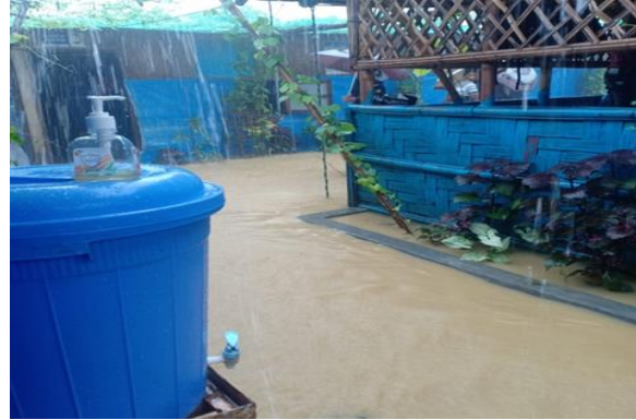
Submerged facility premise