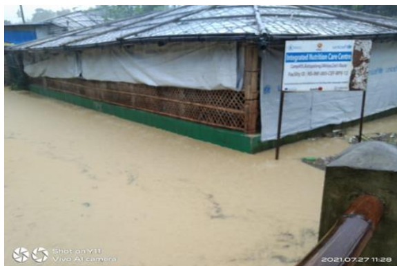
Flood situation outside the facility