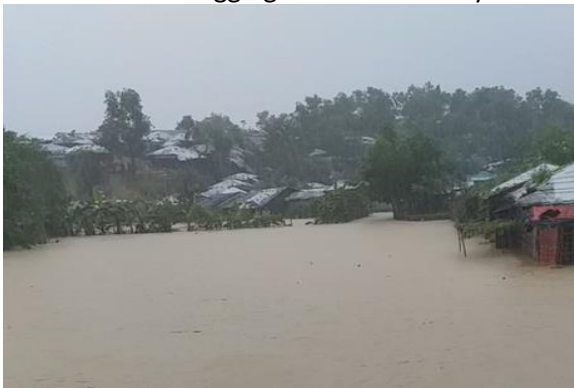
Flood situation in the community