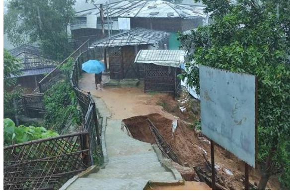
Damaged pathway near the facility