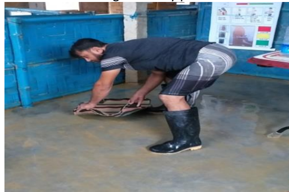
Removing clogged water