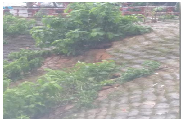
Damage at barrage near the INF