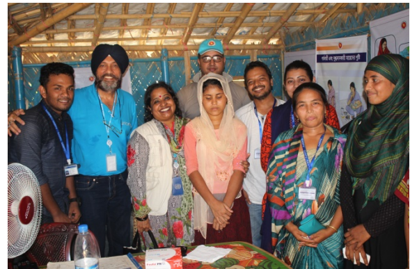
UNICEF Nutrition Team visit at the MBA of Camp 3