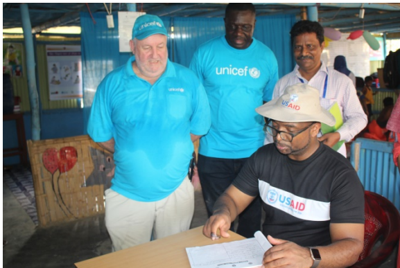
USAID visit at Kutupalong OTP 1