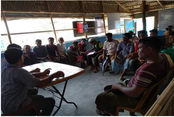
Majhi Meeting at Unciprang OTP 2