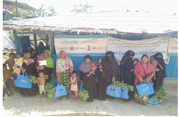
Beneficiaries who received vegetable from Kutupalong OTP 3